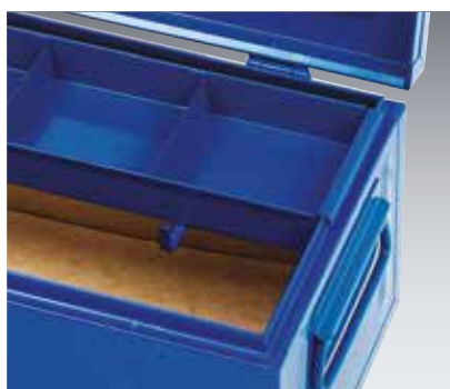
Removable tray and heavy duty grab handles